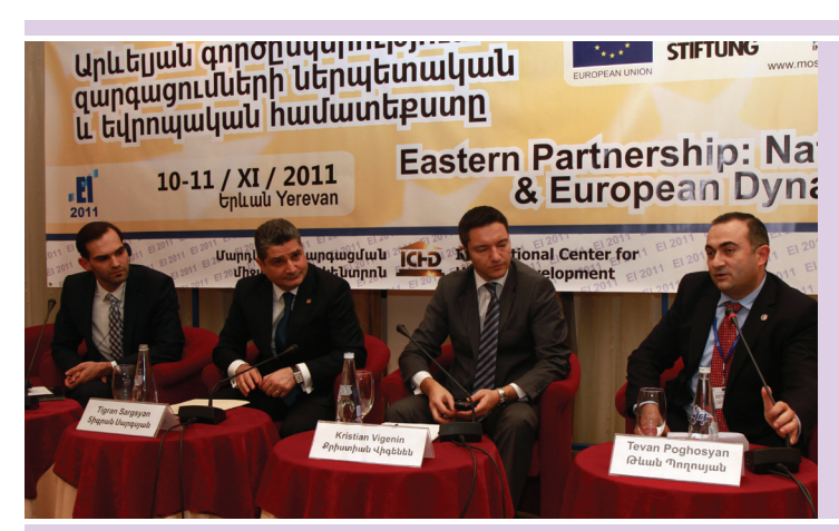
At the ICHD annual European Integration conference. November, 2011.

In November, 2011 ICHD organized two international conferences: "Eastern Partnership: National & European Dynamics" and "The Two Pillars of European Integration: Values and Practices". The first, held on November 10-11, was the 7<sup>th</sup> annual conference on EU integration. It hosted a high-level international discussion on the Eastern Partnership, with a special focus on national and European dynamics. It was organised with the support of the EU Delegation to Armenia, the Mosaic Institute and the Friedrich Ebert Foundation.