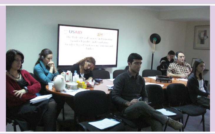
Round table discussion on Armenia - Turkey rapprochement. December 2011. Yerevan.

be possible unless Turkey recalled any pre-conditions it had put forward. However, the stalemate in the official relations did not stop Track Two projects in progress, among which SATR, which started in October 2010, and has been implemented through a common effort of Project Consortium members: ICHD, Eurasia Partnership Foundation, Yerevan Press Club and UMB(E)A.