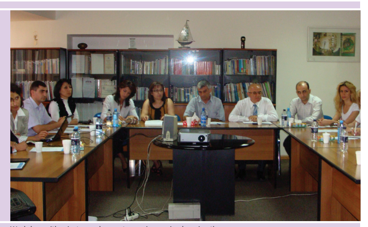
Workshop with private employment agencies on circular migration. September 2011, Yerevan.

T his is one of the long-term projects ICHD started in December 15, 2010. The overall objective of the action is to enhance the management of labour migration flows from Armenia to EU countries through enhancing the capacities