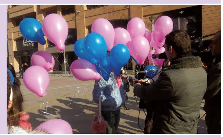
ICHD organizes a flashmob on sex selective births in Armenia during 16 days of activism against GBV. November 2011. Yerevan.

For the last year the major outcomes of the project were two research publications "Taking the reins: Effects of an open Armenian - Turkish border and its significance on European Integration" and "Perspectives for Development of Transport and International Corridors in Armenia, Turkey and the Region", available online at <a href="http://www.ichd.org">http://www.ichd.org</a>. Another significant achievement was the formation of a functional professional network of Armenian and Turkish civil society organizations and business communities. These networks organized advocacy summits, expert discussions, videoconferences, exchange visits, round tables and four town hall meetings, each targeting a different aspect of the rapprochement process.