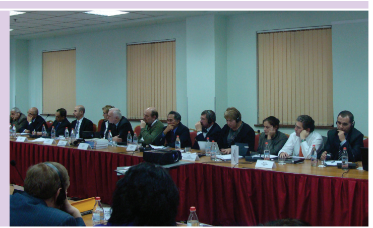
World's top policy experts and academicians on population and development at the ICHD organized work shop "ICPD agenda in EECA region: 7 billion: Balance, Rights and Equity". October 2011. Yerevan.

The aim of the technical meeting was to help identify gaps and challenges, consolidate lessons learned over the last years, and come up with practical recommendations for accelerating progress in Eastern Europe and Central Asia. Fertility, migration, ageing and mortality have been identified as the most prevalent trends shaping the future demographics of Eastern Europe and Central Asia and the experts shared expertise on each of the issues and made relevant recommendations to address the challenges in the mentioned regions.